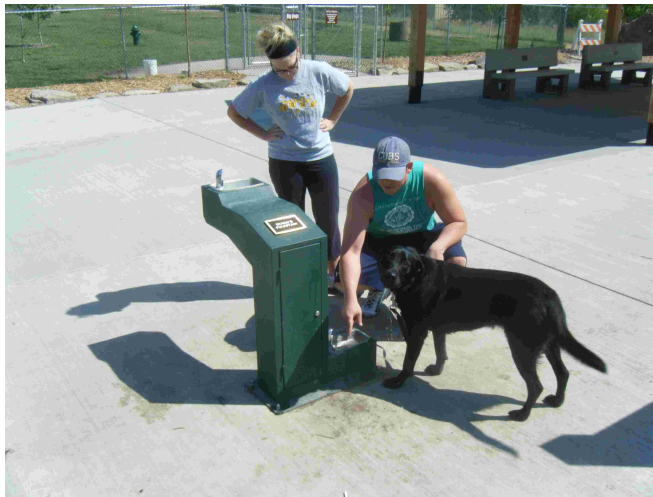
Photo of Accessible Water Fountain With Dog Water Station Desired This Photo Was Taken at the Trailside Dog Park in Great Falls, MT