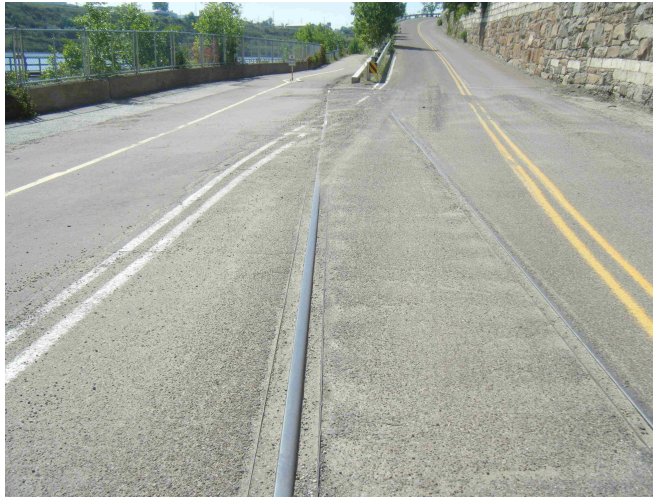
Photo of Railroad Tracks in Access Road